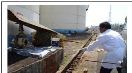
Introducing the radiotracer in the tank of IOCL.

BRIT provided isotope application services to Indian Oil Corporation Ltd. (IOCL) and HPCL for leakage detection of underground pipeline & gamma scanning of process columns respectively.