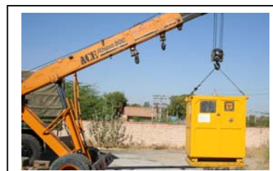
Gamma Chamber (GC- 5000) for export to Poland